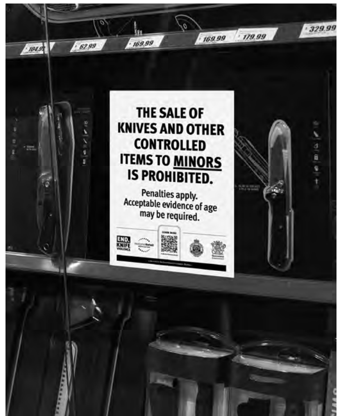
Example of display