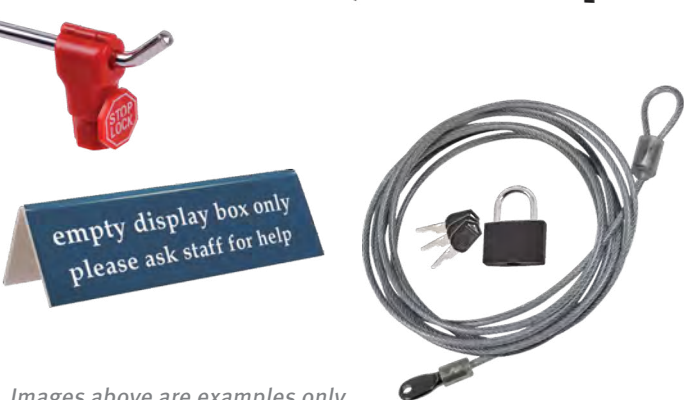
Images above are examples only